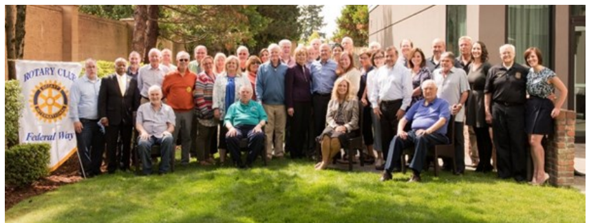
In 2018, the Rotary Club of Federal Way gathered for a group photo.