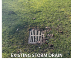
EXISTING STORM DRAIN

Water often collects in this low point of the park due to slow or ineffective stormwater runoff infiltration and drainage creating conditions unfavorable to park users. Improve the existing drainage system in key areas of the park to intercept stormwater runoff from the parking area and roadway to reduce pooling around the existing storm drains in this area.