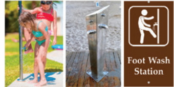
Foot Wash Station

In order to more accommodate to beach users and to avoid future recurring plumbing issues caused by sand tracked into the restroom, provide a convenient foot rinsing station at the edge of the beach near the restroom for beach users to rinse off any sand.