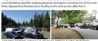
EXISTING PARKING LOT FULL & VEHICLES PARKED ALONG ROADWAY

Parking is challenging on a busy summer day often resulting in vehicles parked on the curb or on the public roadway, but options for parking area expansion are limited and difficult to achieve without sacrificing valuable park space. In order to accommodate, the existing non-regulation basketball hoop and half court has been identified as an unpopular park feature that could be removed to extend the existing gravel parking area on the west side of the park southward to provide additional parking for approximately 10-20 vehicles.