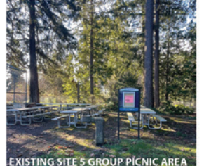
EXISTING SITE 5 GROUP PICNIC AREA

Site 5 is the only reservable group picnic site and is tucked away in a forested area that provides a more private experience. Site 5 includes an informal unpaved parking area accessible from a service road off the main entrance drive. Other amenities unique to Site 5 include enough picnic tables to accommodate for large groups, a baseball/softball diamond, and a port-a-potty. To improve upon the already popular picnic site, provide additional amenities such as a covered shelter over the picnic tables, permanent restroom facilities, and electricity, including lighting. To improve upon the access and circulation to better serve large groups, further delineate parking, widen the access road to accommodate for two-way traffic, and explore the option of grading or resurfacing the parking area and roadway.