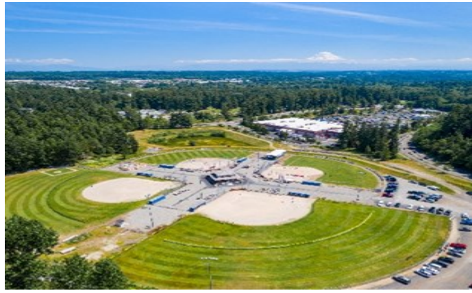
Drone photo of the Federal Way National Little League complex.

This year, 525 children ages 4-16 are competing in baseball and softball, which also includes a unique division, the Challenger . Challenger Division, established in 1989, is a baseball program geared towards boys and girls with intellectual or physical challenges from ages 5 through 21.