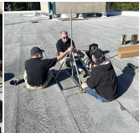
The City of Federal Way thanks the Federal Way Amateur Radio Club for its invaluable contribution in restoring our radios to full operations and volunteering to operate our Emergency Operations Center (EOC) radios during emergencies. It's a critical step in ensuring the safety of our Federal Way community!