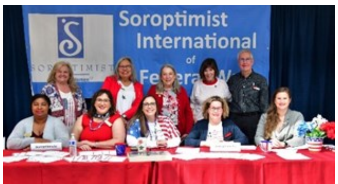
Soroptimists at the Flag Day Celebration.

In February, the Live Your Dream Scholarship celebration is held. This scholarship is presented to women who overcome obstacles to obtain further education. Each year, the Soroptimist International of the Americas gives away over $2.9 million towards this scholarship opportunity, and Federal Way is no different! This year, over $2,000 from the Federal Way chapter was given out to two very deserving winners.