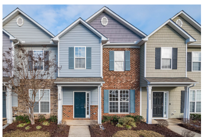
Fourplex Source: City of Olympia Townhomes