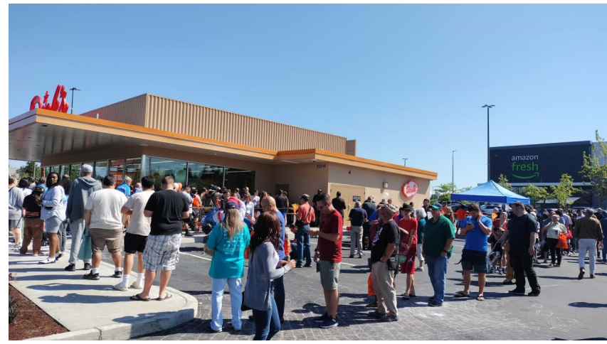
On Thursday, July 27, our community eagerly lined up for the delicious food at the Dick's Drive-in location in Federal Way. Since its muchawaited grand opening, this location has been constantly bustling with customers!