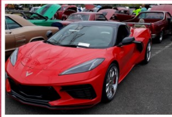
2022 BEST OF SHOW