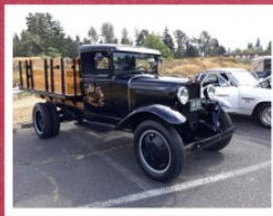
2022 LION'S AWARD