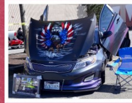
2022 PEOPLE'S CHOICE