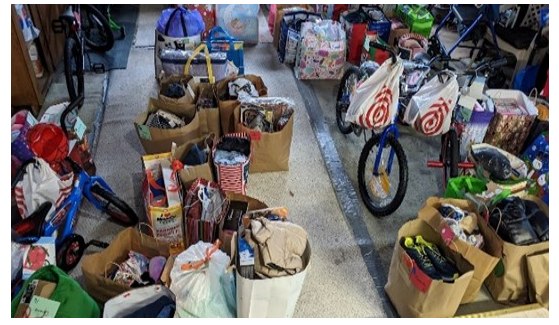
The 2022 Holiday Haul is ready for delivery to Wildwood Elementary.