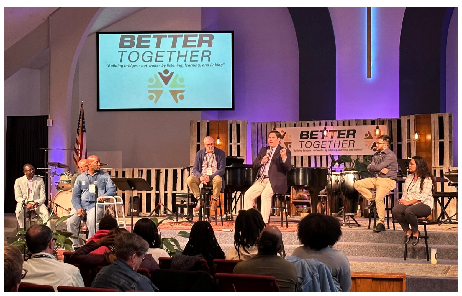
On November 4, Mayor Ferrell presented proactive strategies and recommendations on how the faith community can collaborate with the City of Federal Way. During the Better Together panel, Mayor Ferrell emphasized the importance of the faith community and local government working together to provide shelter and food and combat unemployment.

Mayor Ferrell's participation in the Better Together conference panel at Kent Hillside Church on November 4 was an inspiring display of the progress achieved when government and faith communities gather to discuss the challenges their communities face.