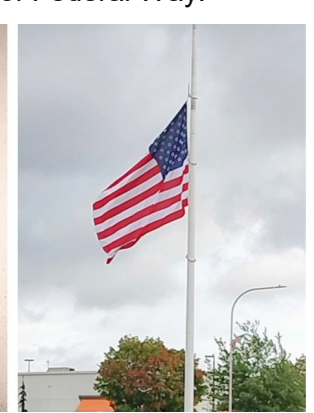
CITYWIDE NEWS— THE CITY OF FEDERAL WAY