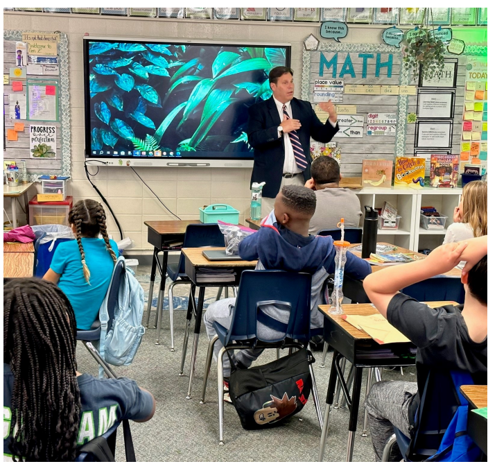
At Adelaide Elementary's career day event, Mayor Ferrell visited several classrooms, where the students eagerly asked excellent questions about his journey to become our Mayor of the City of Federal Way!