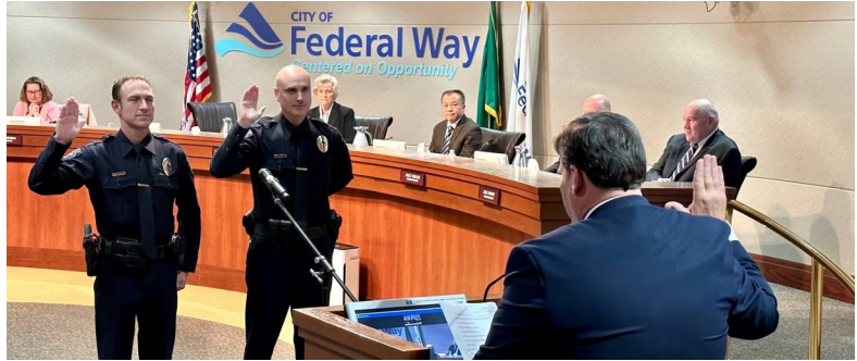
Mayor Ferrell administers the Oath of Office in Council Chambers during the City Council meeting on October 17, in front of their family and friends.