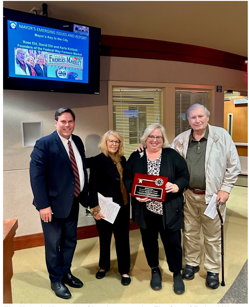
The Mayor's Key to the City plaque reads: The City of Federal Way appreciates all you do at the Federal Way Farmers Market, celebrating its 20th anniversary. Your family unites our community, organizes the vendors, and creates a special place in Federal Way with fresh produce, flowers, and other necessities. Your dedication to keeping the Farmers Market going during COVID is inspiring. The Farmers Market has been a family affair and adventure. Thank you!

We look forward to attending the last day of the Federal Way Farmers Market on October 28 at The Commons!