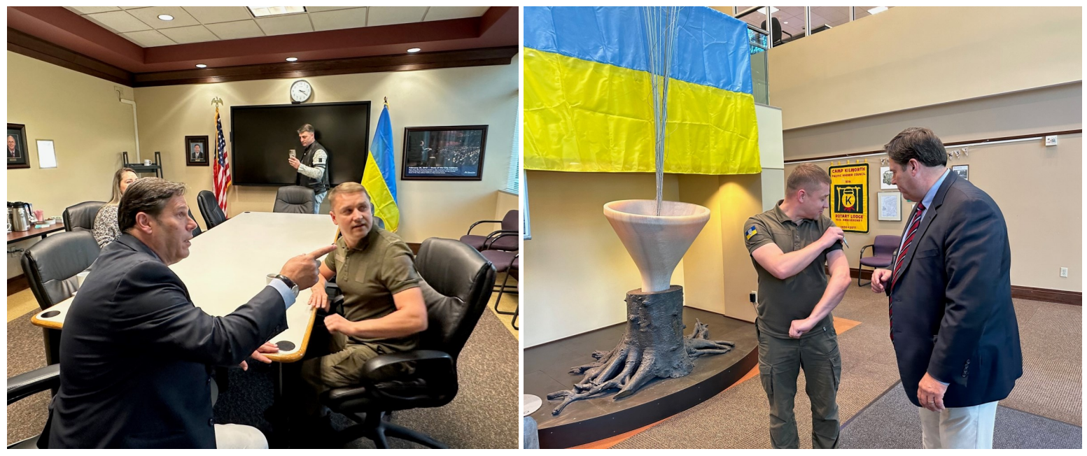
Mayor Oleksandr Tretyak of Rivne, Ukraine, presented Mayor Ferrell with a patch worn during the battle with Russia in Ukraine. The City of Federal Way stands in solidarity with our brothers and sisters in Ukraine in their fight for independence and freedom.

It was an honor to welcome Mayor Oleksandr Tretyak from our Sister City in Rivne, Ukraine, to City Hall on October 27! Mayor Ferrell had a great meeting with him, where they discussed common interests and exchanged views.