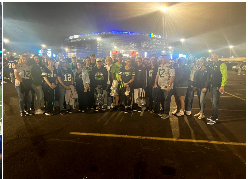
Monday Night Football at MetLife Stadium! The 12s always travel well and watched Bobby Wagner and Seattle's defense wreak havoc on New York Giants quarterback Daniel Jones in East Rutherford, New Jersey, on October 2.