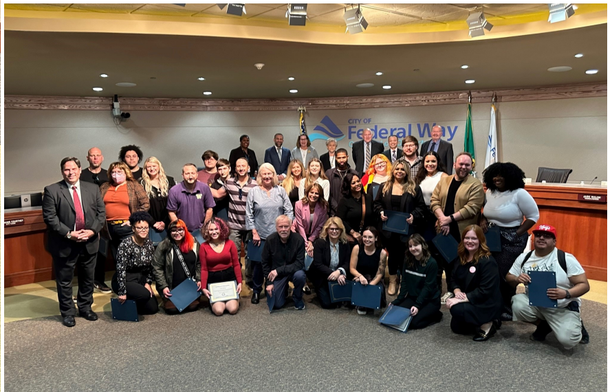
The Mayor's Key to The City plaque reads: The City of Federal Way thanks you for organizing a free back-to-school haircuts event at Town Square Park on August 28, 2023. Your can-do attitude is an inspiration to us all.