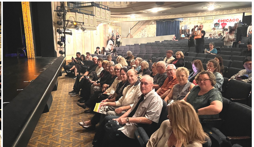
They're Going All Out And Living It Up! The group secured front-row seats for "Chicago The Musical" on Broadway in New York! Through this longstanding partnership, these distinguished seniors have had the privilege of rediscovering and relishing the splendors of visiting destinations such as New Orleans, Chicago, and Arizona.