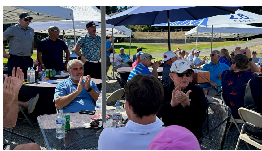
On September 8, King County Councilmember Pete von Reichbauer, showing his support for the Seahawks this season, was on hand for the North Shore Golf Course festivities!