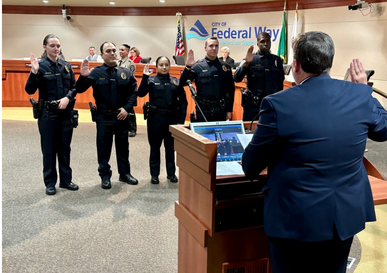
The Mayor administered the Oath of Office during the City Council meeting on September 19, while their family and friends watched with admiration.